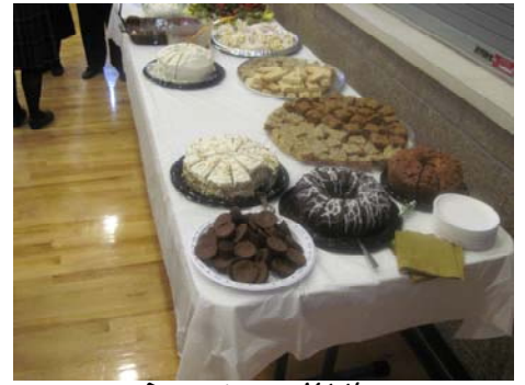
Desserts .... YAA!