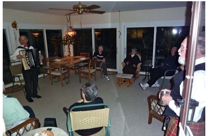
A sing along