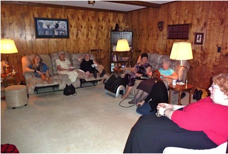
Kickin' back to rest some really weary feet at the afterglow.