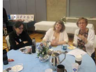
These breaks sure are short...