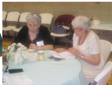
Last minute study time ....