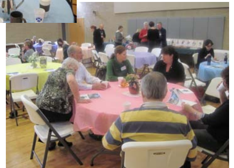
Workshop