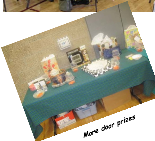
More door prizes