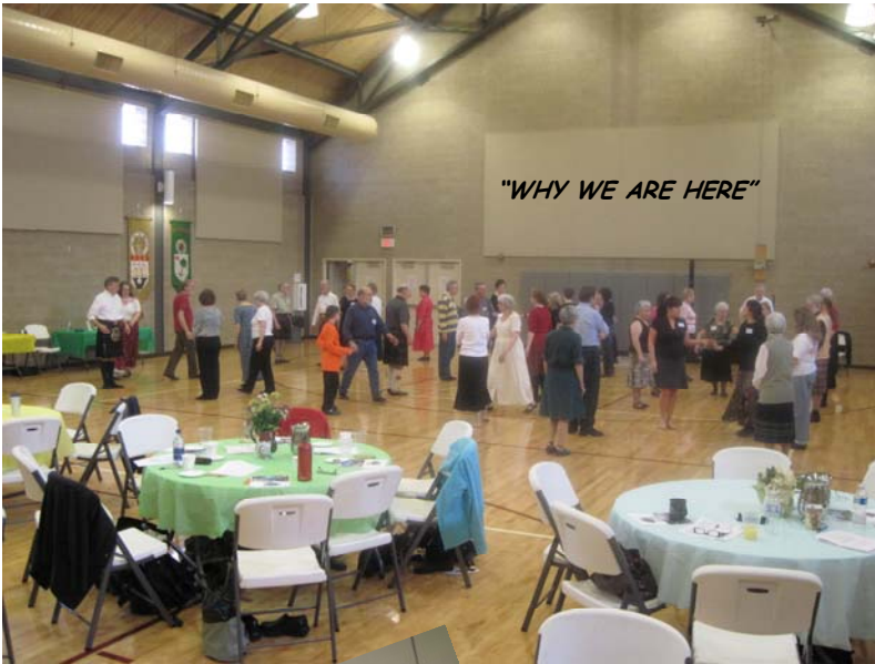
"WHY WE ARE HERE"